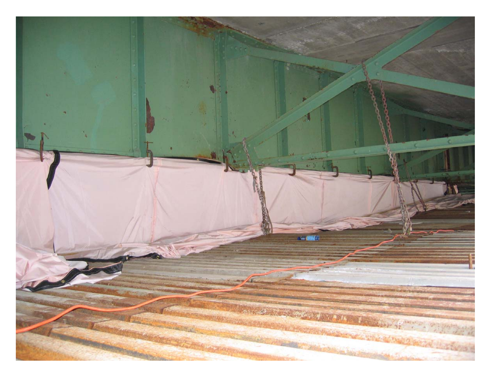
Cable Supported/Metal Deck Platform System & Side Containment