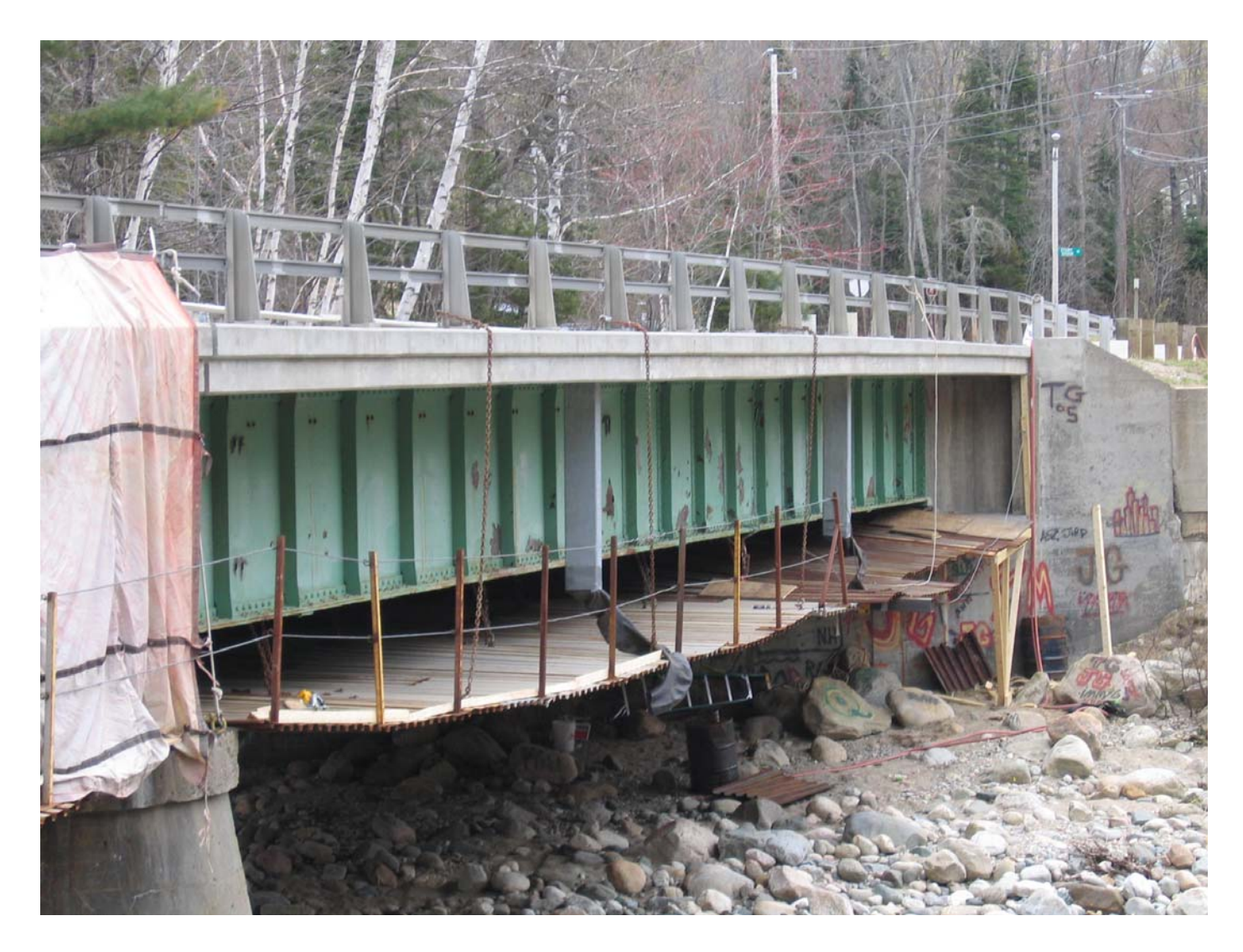
Cable Supported/Metal Deck Platform