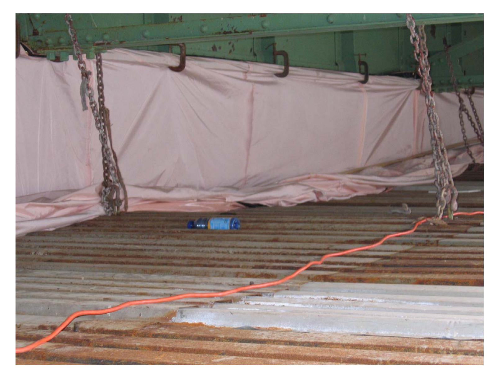
Cable Supported/Metal Deck Platform System & Side Containment