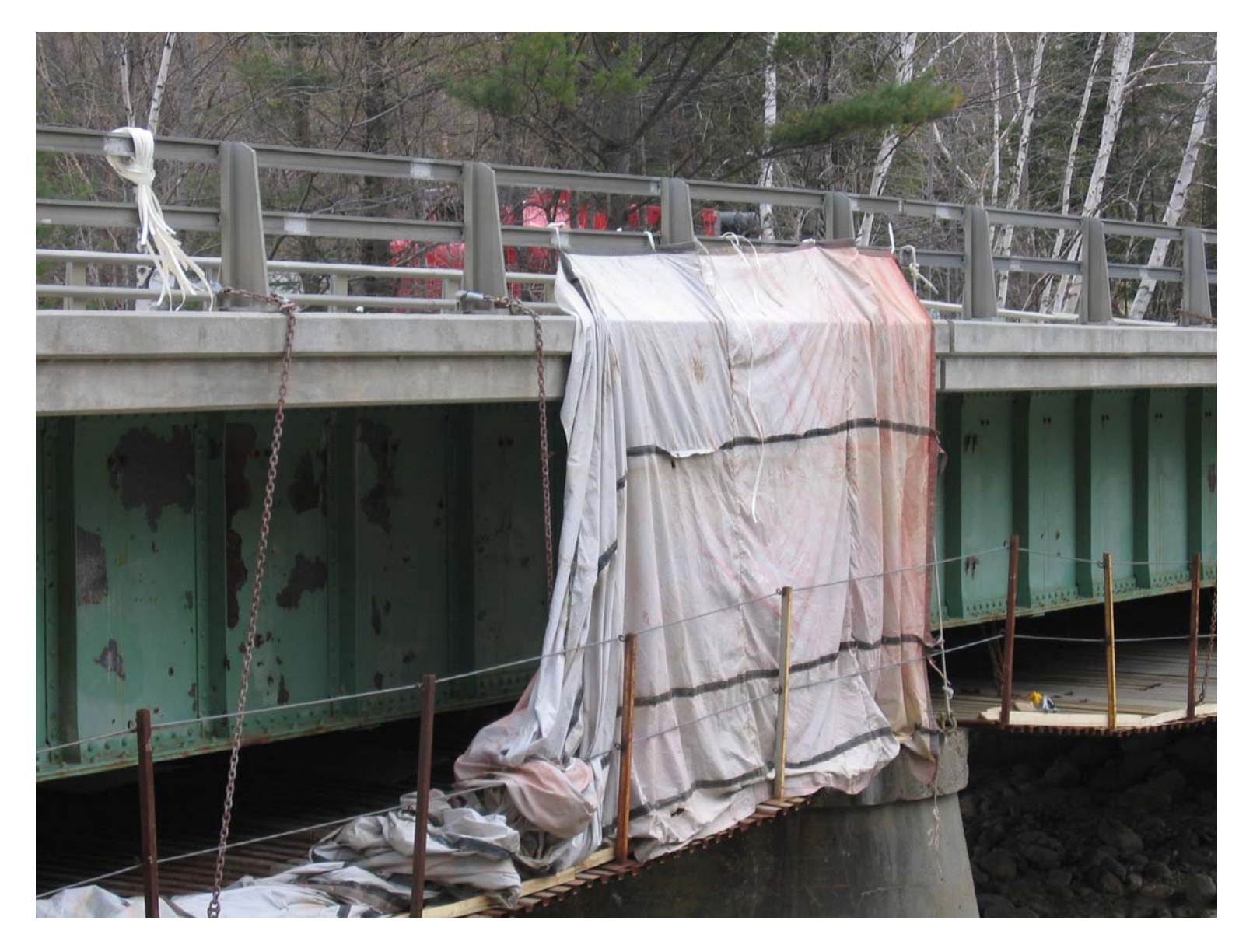
Cable Supported/Metal Deck Platform System & Containment